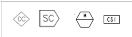
Examples of Special Characteristic symbols

Significant Characteristic (SC) - A Significant Characteristic is defined as a product characteristic or manufacturing process parameter which can affect fit, function, performance or impact subsequent processing of product.